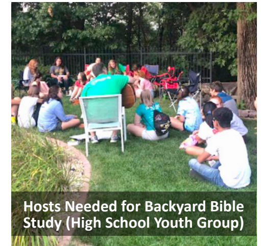
Hosts Needed for Backyard Bible Study (High School Youth Group)