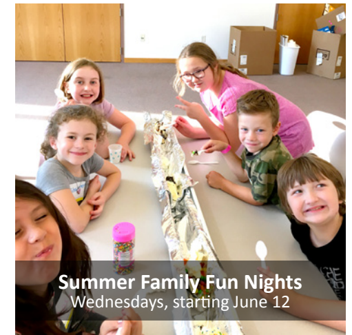
Summer Family Fun Nights Wednesdays, starting June 12