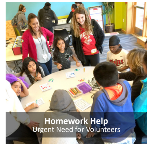
Homework Help Urgent Need for Volunteers