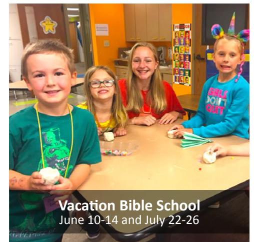
Vacation Bible School June 10-14 and July 22-26