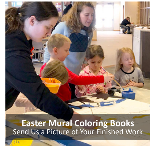
Easter Mural Coloring Books Send Us a Picture of Your Finished Work