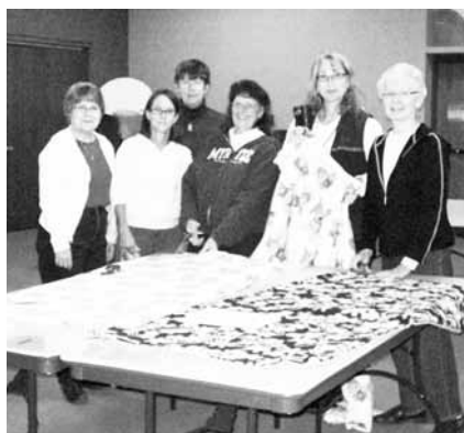
Assembling fleece blankets during an Encore! event